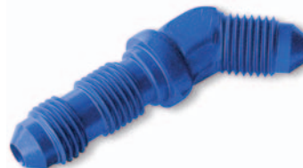
JIC (AN) Male x JIC (AN) 45° Bulkhead