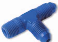
JIC (AN) Male Tee NPT Thread on Run