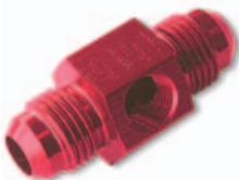
Fuel Pressure Take-Off Adaptor