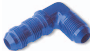
JIC (AN) Male x JIC (AN) 90° Bulkhead