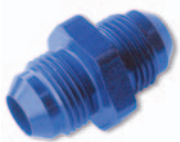
JIC (AN) Male x JIC (AN) Male Equal Thread