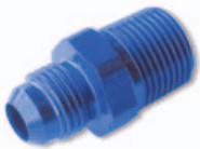
JIC (AN) Male x NPT Male