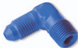
JIC (AN) Male x NPT 90° Male