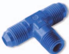
JIC (AN) Male Tee NPT Thread on Branch