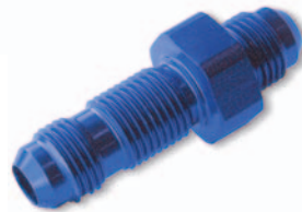
JIC (AN) Male x JIC (AN) Bulkhead