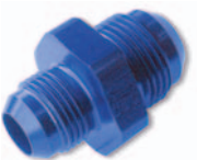
JIC (AN) Male x JIC (AN) Male Unequal Thread