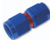
Straight Female x Female Swivel Coupling