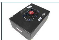
45L Saver Cell